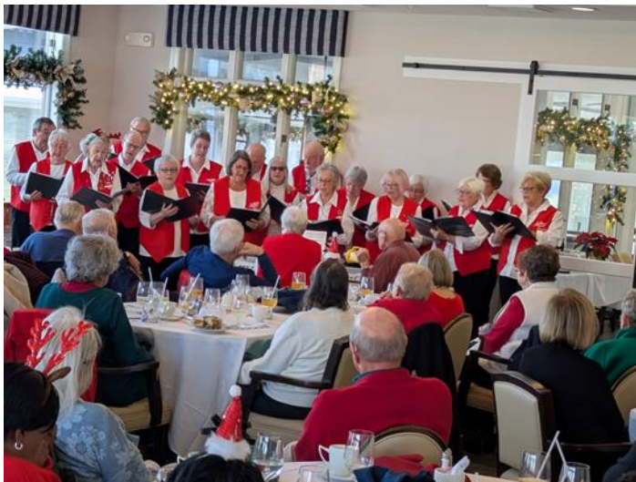
The Singers of Note performing at the Chapter's December 2024 Luncheon Meeting at Cripple Creek Country Club