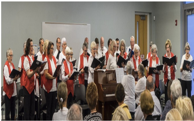
Chorus Concert at the South Coastal Library